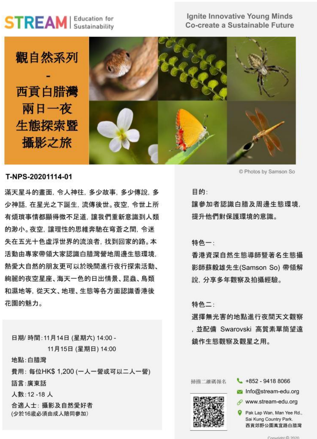
Figure 9: Advertisement on Social Media